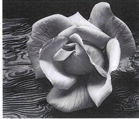
Rose and Driftwood, San Francisco, California (c. 1932)