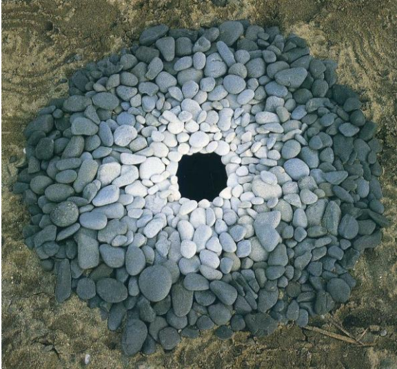
Pebbles around a hole , 1987

Sculptor, photographer and environmentalist