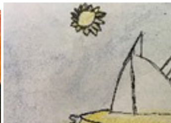
The Opera House by Tanishka