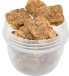
Wholegrain cereal bites

For more lunchbox myth busters visit: www.swapit.net.au/myths